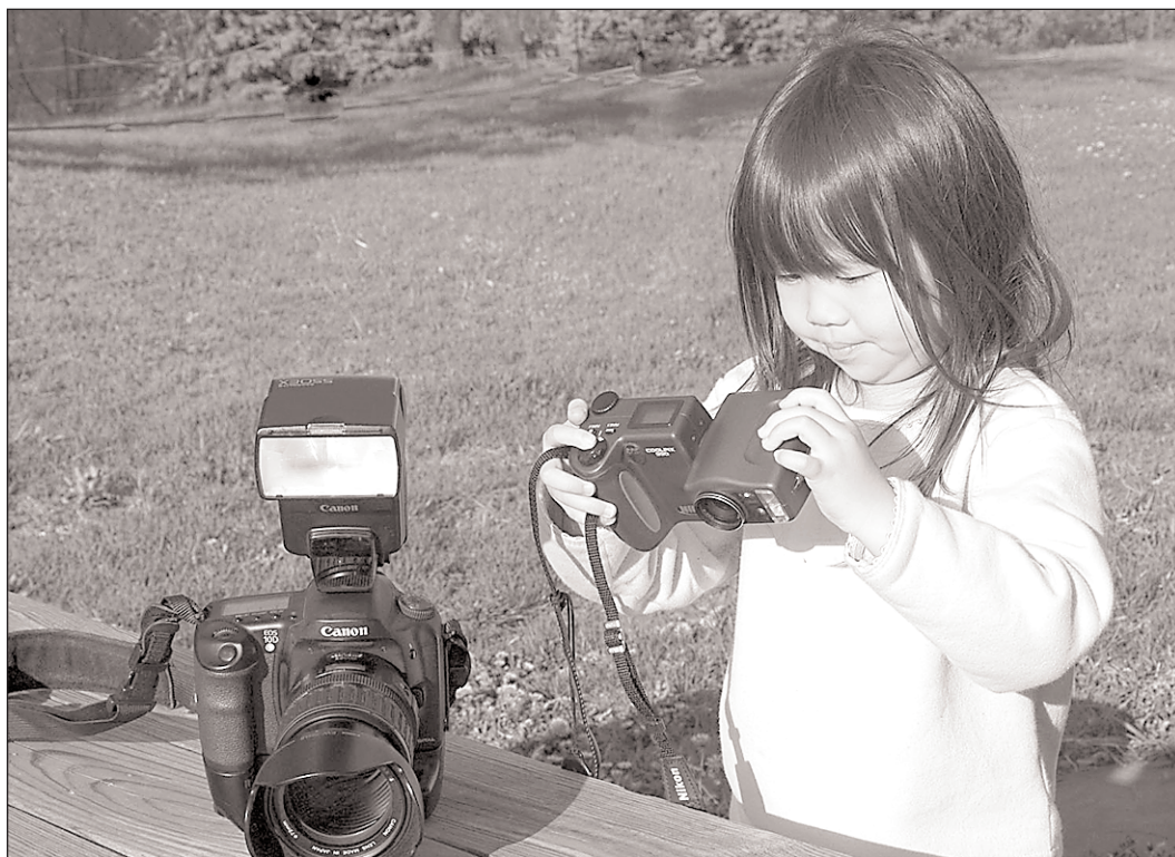
This image shows the difference in size between a DSLR and a compact point and shoot. What isn't conveyed is the weight difference. The subject was nearly pulled to the ground when I attempted to hang the camera around her neck.

Lenses — The zoom range of some P&Ss is so large, it would require multiple lenses for a DSLR to match. And if you have ever worked with a DSLR, you know that changing lenses is time consuming and a way of introducing dust into the camera. Usually even