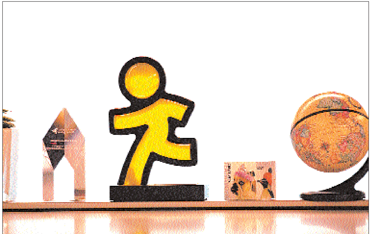
Above, the AOL Running Man logo and other decorations are shown in AOL's New York office Monday, while, at right, an AOL Web site is shown on a monitor on a wall of the company's New York office. A company rooted in bringing the Internet to the masses, AOL is shifting its focus toward serving niche audiences with the launch of dozens of specialty Web sites.

"AOL currently implies legacy. It implies old. It implies out of